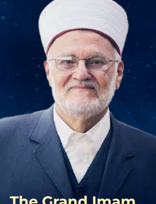
The Grand Imam of Masjid Al-Aqsa